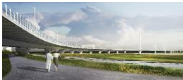
The new bridge as it crosses St Helens Canal in Widnes

The Merseylink consortium is made up of experienced sponsors with a track record in delivering major infrastructure projects, alongside their construction and operational partners, who are world leaders in their field.