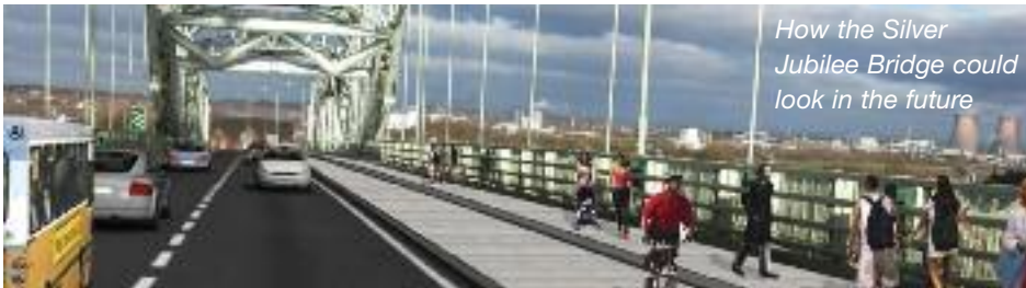
How the Silver Jubilee Bridge could look in the future

Across the region, Mersey Gateway is seen as a transformational project that will drive economic recovery and in particular support expansion at Liverpool Ports and Liverpool John Lennon Airport.