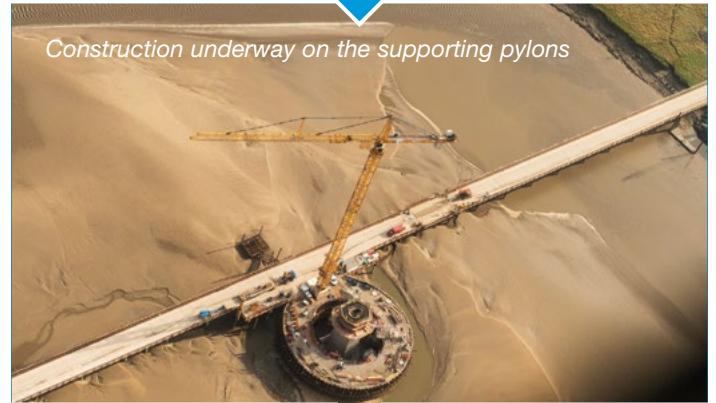
Construction underway on the supporting pylons