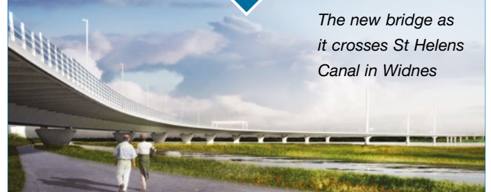
The new bridge as it crosses St Helens Canal in Widnes