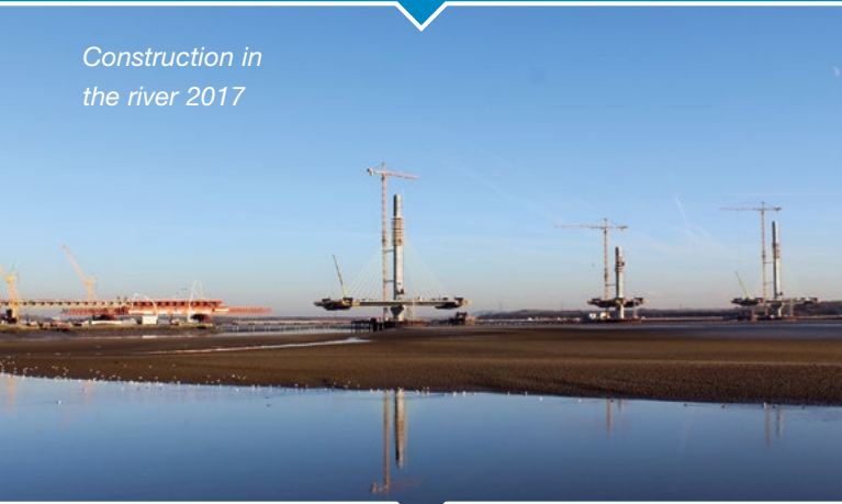
Construction in the river 2017

Once open, the new bridge will carry up to six lanes of traffic and will have a speed limit of 60mph.