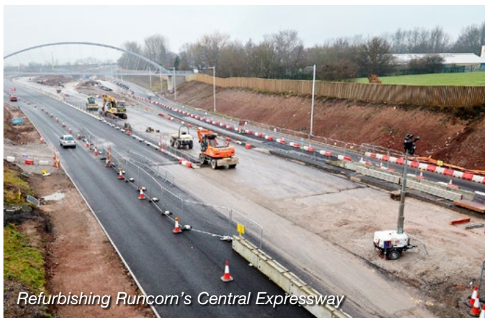
Refurbishing Runcorn's Central Expressway

The £1.86 billion lifetime cost includes the design, build, finance, operation and maintenance of the project through to 2044. The majority of the funding comes from the tolls paid by road users, but there is also a contribution from the UK Government.