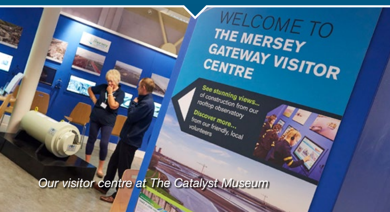
Our visitor centre at The Catalyst Museum

In Widnes, our volunteers also host trips to the Catalyst centre’s rooftop observatory, where visitors can get a bird’s eye view of the construction work that is taking place in the estuary.