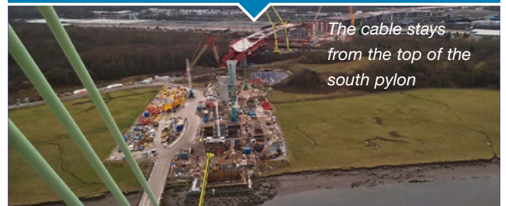
The cable stays from the top of the south pylon

Roads start re-opening across Runcorn and Widnes First of 146 cable stays installed on the new bridge